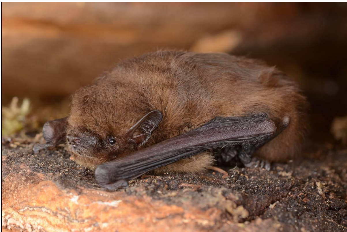
Fig. 1: Bat of the year 2015: Nathusius' pipistrelle ( Pipistrellus nathusii ).