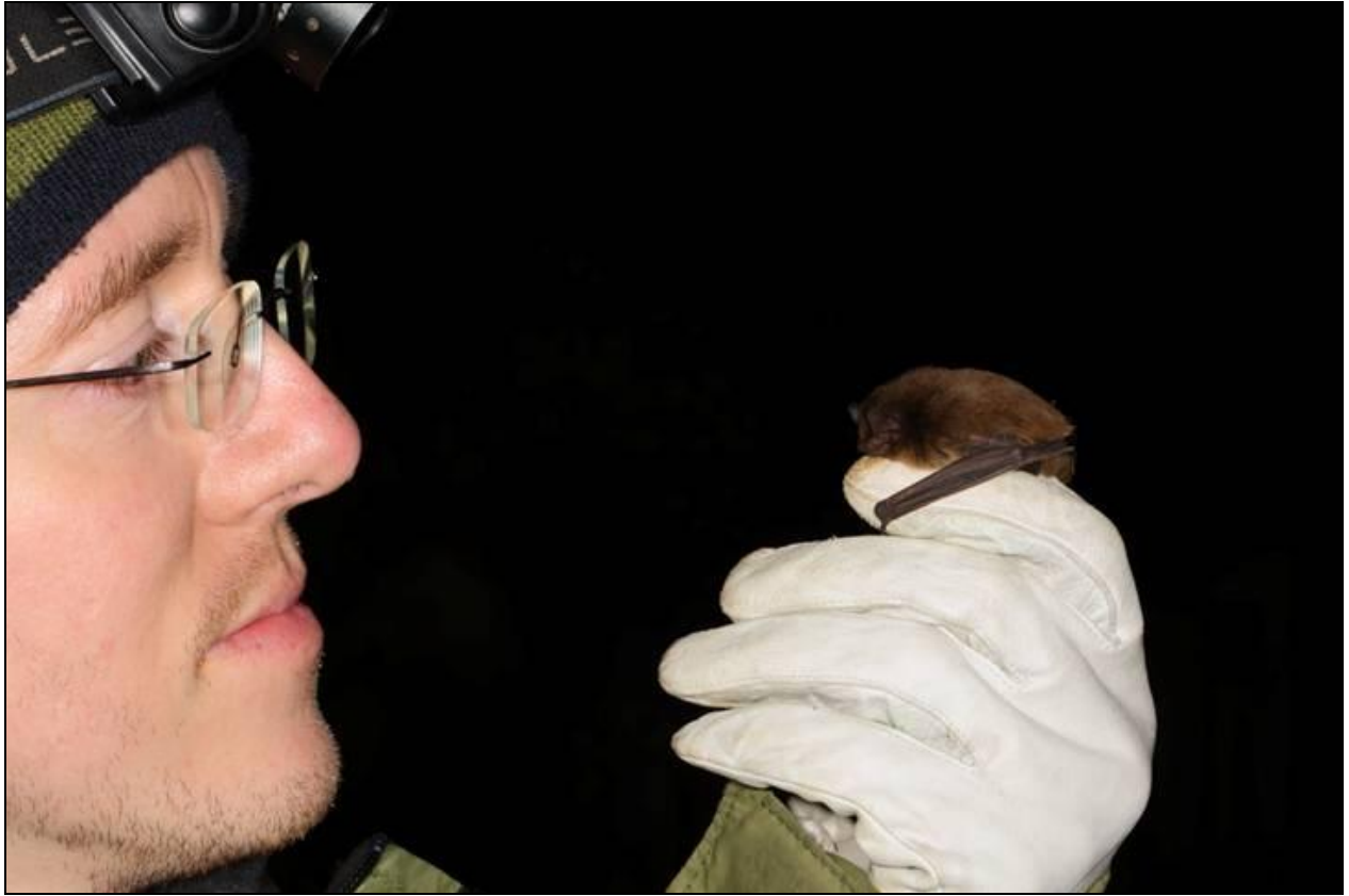
Fig. 4: Research and conservation projects in the UK and Central Europe focus on Nathusius' pipistrelle.